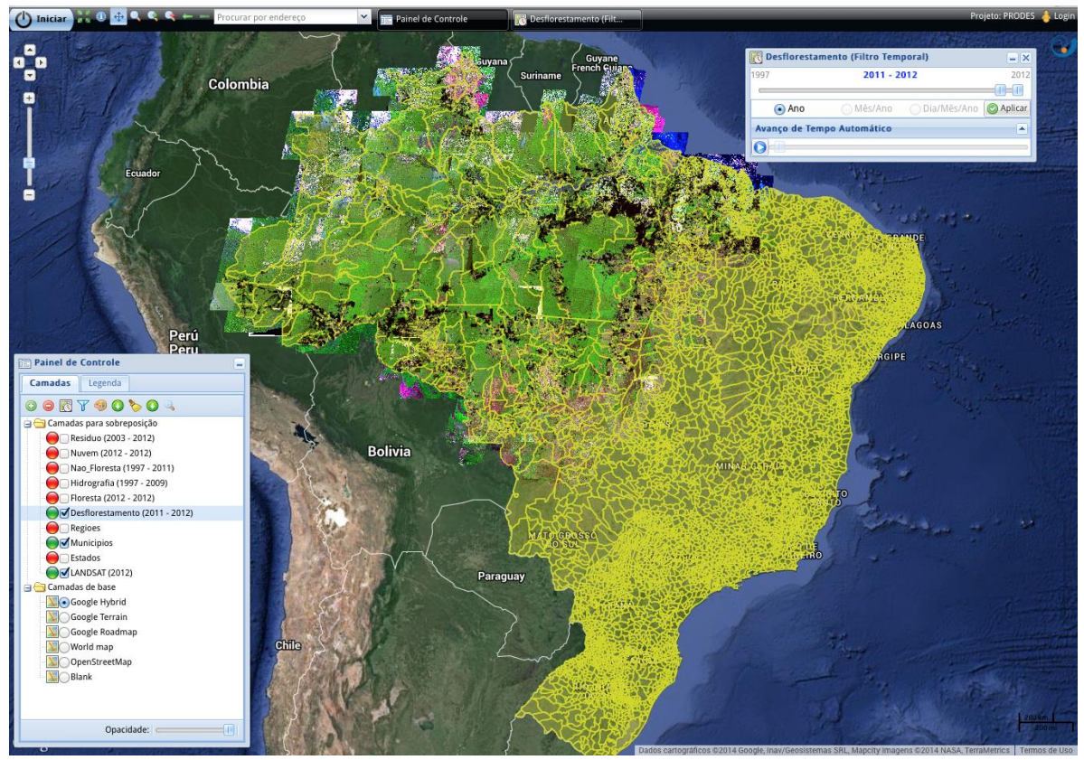
Figure 2 – The web geospatial portal TerraBrasilis

On top of the databases, we propose the use of web services to disseminate them on the Internet. In most case, we use well-established OGC standards for web services, such as WMS, WFS and WCS. This compliance assures spatial data interoperability among distinct SDIs as well as between SDIs and GIS tools. In some particular cases, we need to define and create web services dedicated for specific tasks. An example is an in-house web service responsible for extracting time series from remote sensing images that was built on top of the SciDB database system.